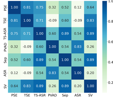
Fig. 3. The Spearman's rank correlation between tasks.

others, possibly because of denoising strategies incorporated during their pre-training stage as data augmentation.